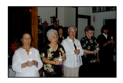
Candles for Peace Lighting Up Our World HAIB Peace Service, September 27

Deadline: Need to commit by Nov. 30 If interested, call Rev. Oyama at (808) 579-8051.