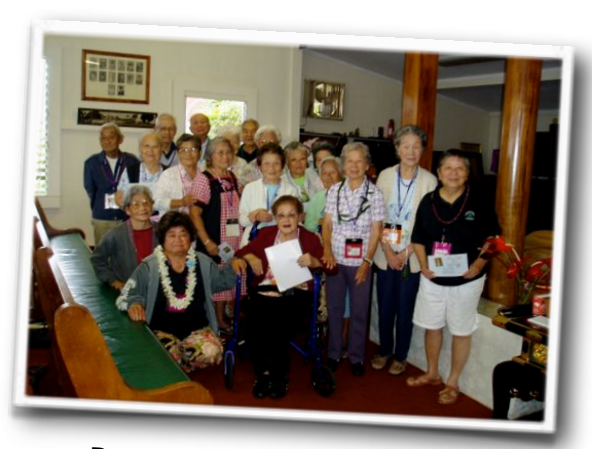
Project Dana Kupunas