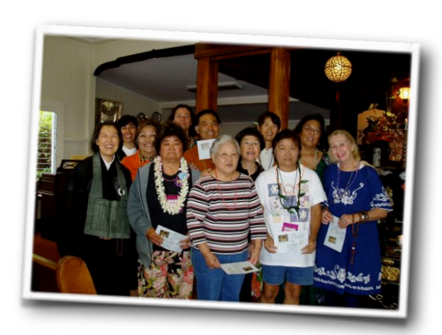
Project Dana Volunteers