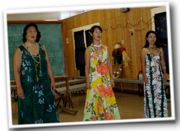
Offering Their Gift of Hula & Chant