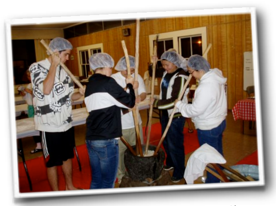
Mochi Making the Traditional Way