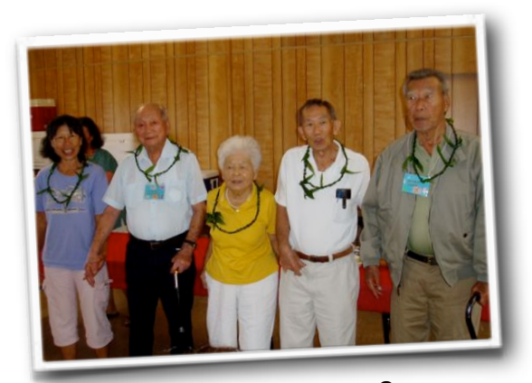
The Happy January Birthday Group

The shop will be open after major services and at occasional other times (such as by appointment). Volunteering need not take up too much of your time. You will enjoy it---guaranteed!