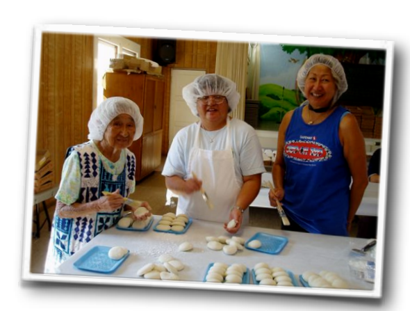
Polishing the Mochi to Perfection