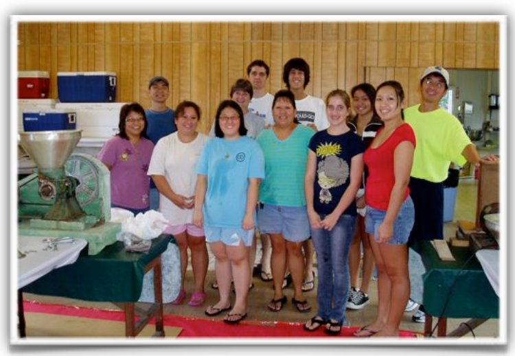
Mahalo for supporting the mochitsuki!