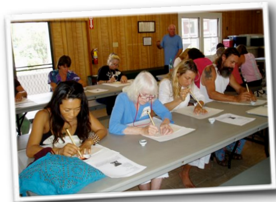
Zen Day attendees tracing a picture of Kannon-sama

A schedule of festival events can be found at: http://www.konacoffeefest.com/schedule.asp . Let's all celebrate 40 years of our Kona coffee heritage!