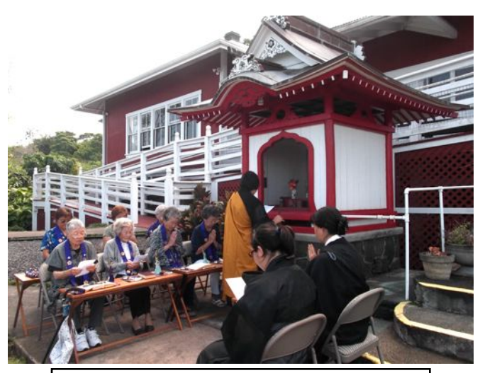
Ojizosama Service on June 19