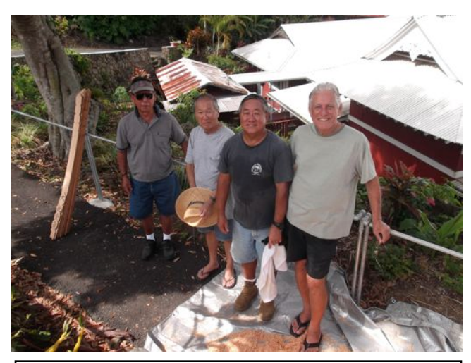
Thank you to the crew that shaved the o-toba boards