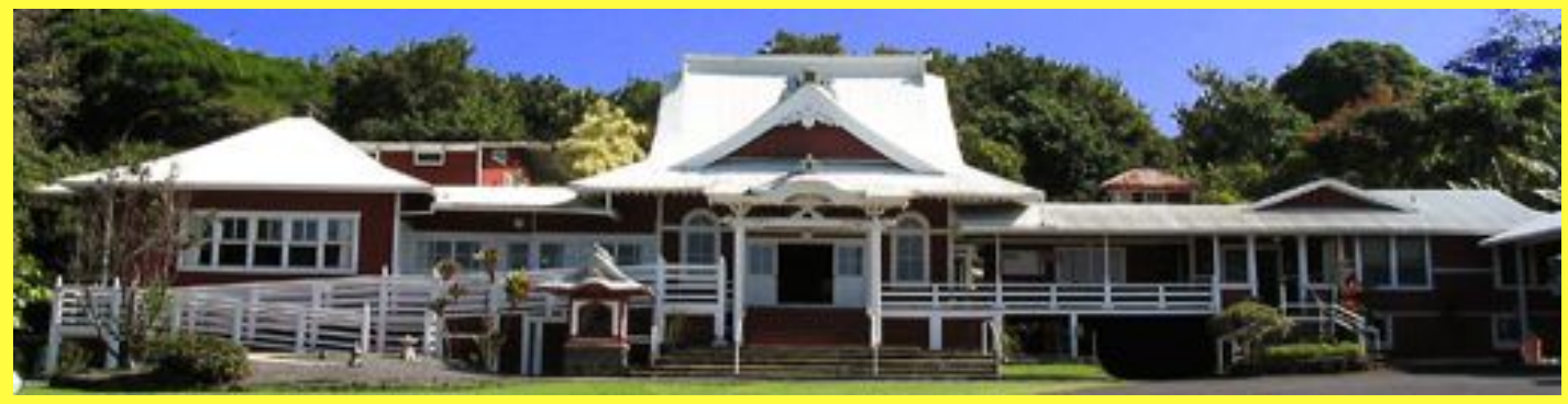
79-7241 Mamalahoa Hwy., Kealakekua, HI 96750

Treasuring the Past, Embracing the Present Looking forward to our 2014 centennial celebration!