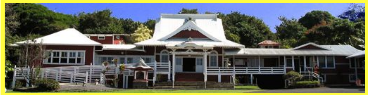
79-7241 Mamalahoa Hwy., Kealakekua, HI 96750