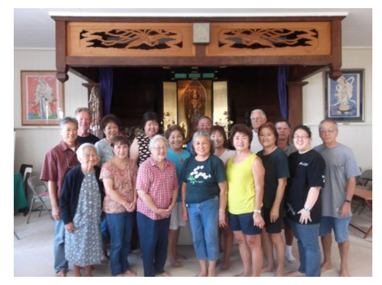
Mahalo nui to the volunteers who set up the 33 Kannon & cleaned the temple for our Ohigan service on March 23.