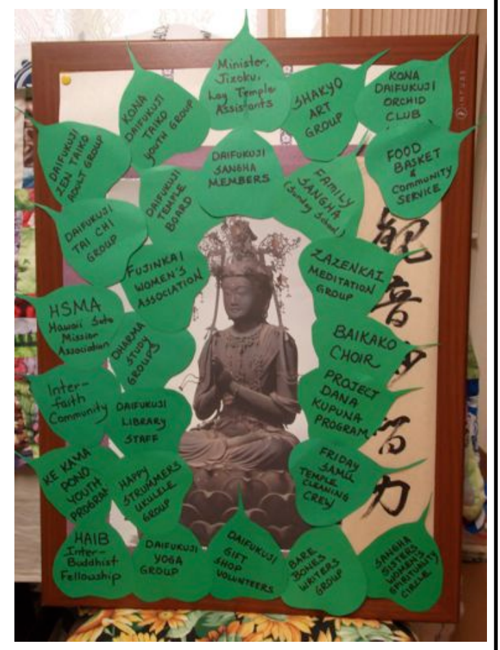
Namu kie butsu. Namu kie ho. Namu kie so.

This is why I'm holding evening envisioning sessions throughout the year. I'd like to know what you think. I'd like to hear about your ideas. What is your vision for our temple? Your voice is important. I invite you to come to the next session at 7 p.m. on March 6th and let your voice be heard. Those present, whether it be two or ten, will be encouraged to listen without criticism or judgment. This is our practice: sitting still, listening deeply, seeing others for who they are, seeing our own views & egos with clarity, speaking from a place of honesty and integrity, and relinquishing attachment to "my way." In the process, we'll create a shared vision out of unique individual views, not some pie-in-the-sky vision, but one that clarifies our mission, gives us direction, and leads us to a bright future.