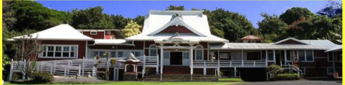
79-7241 Mamalahoa Hwy., Kealakekua, HI 96750

"Okagesama de: Thanks to countless beings, we are here today."