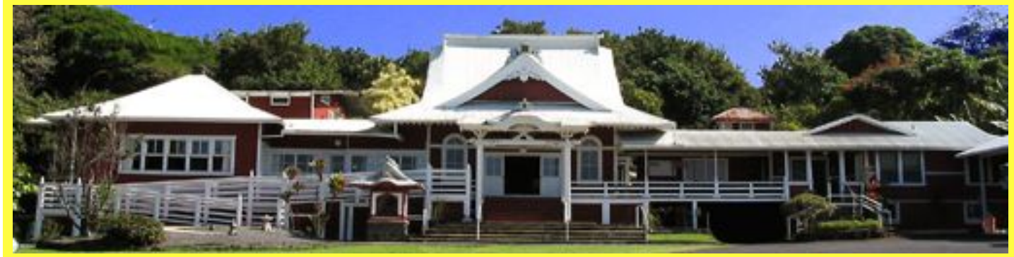
79-7241 Mamalahoa Hwy., Kealakekua, HI 96750