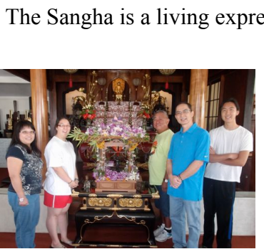
The Hanamido Decorators

So it was at Hanamatsuri. The day before the service there was a group setting up for shakyo, a group decorating the hanamido, a group preparing food in the kitchen, and a group practicing taiko in the cultural hall. The temple was vibrating with life. Sangha life. All in harmony.