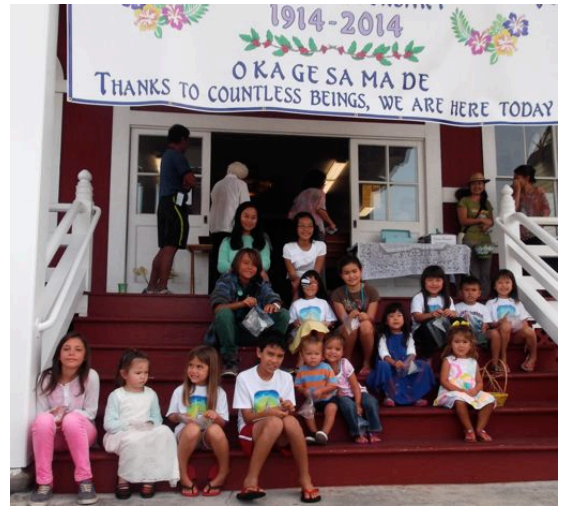
Children waiting for the spring egg hunt to begin after the Hanamatsuri service on April 13

Name kie butsu. Namu kie ho. Namu kie so.