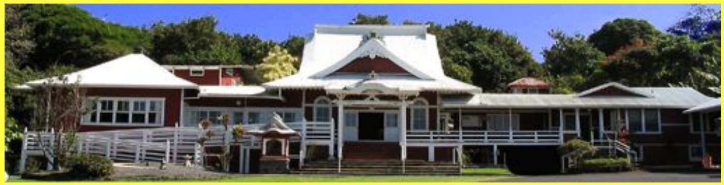
79-7241 Mamalahoa Hwy., Kealakekua, HI 96750