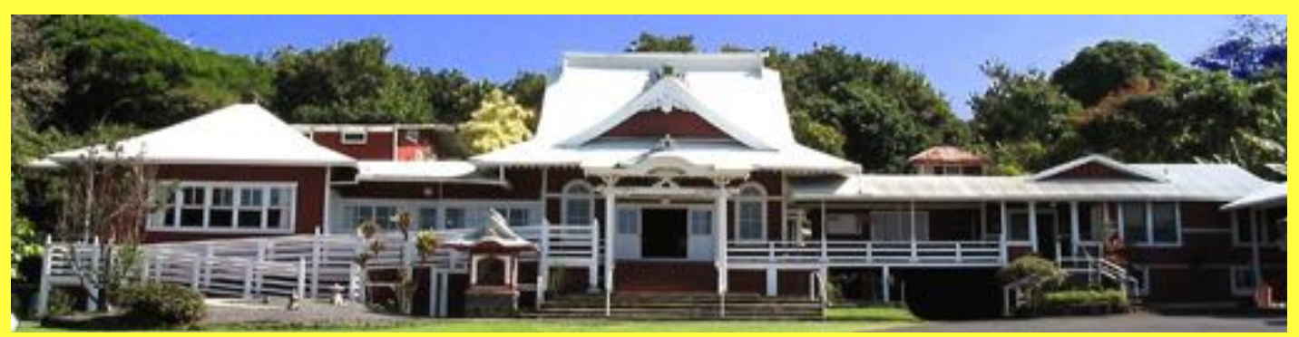
79-7241 Mamalahoa Hwy., Kealakekua, HI 96750