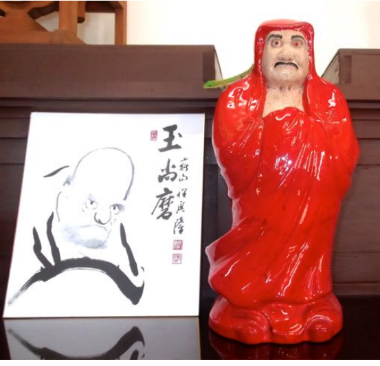
A Little Gecko on Bodhidharma's Shoulder