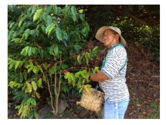
Chester picking coffee in the coffee & mac nut field