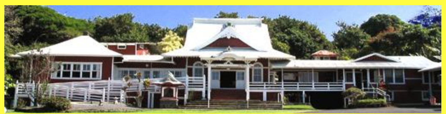
79-7241 Mamalahoa Hwy., Kealakekua, HI 96750