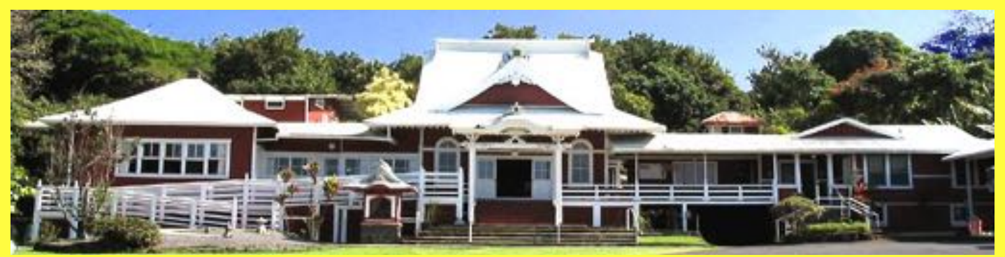
79-7241 Mamalahoa Hwy., Kealakekua, HI 96750