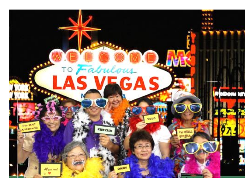
Our Wild & Wacky Daifukuji Bunch — guess who?