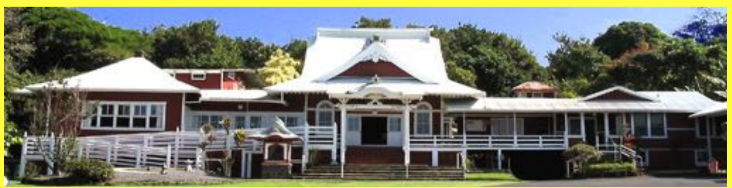
79-7241 Mamalahoa Hwy., Kealakekua, HI 96750