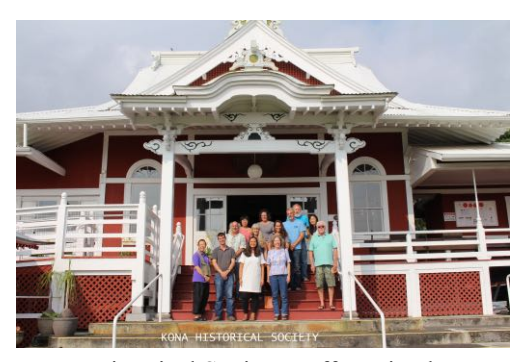
Kona Historical Society staff received a tour of Daifukuji in July.

Open to the public, this ever-popular tour will cover the history and significance of the temple, as well as the interesting and unusual Buddhist objects found inside its doors.