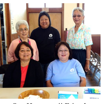
Our Hongwanji Friends