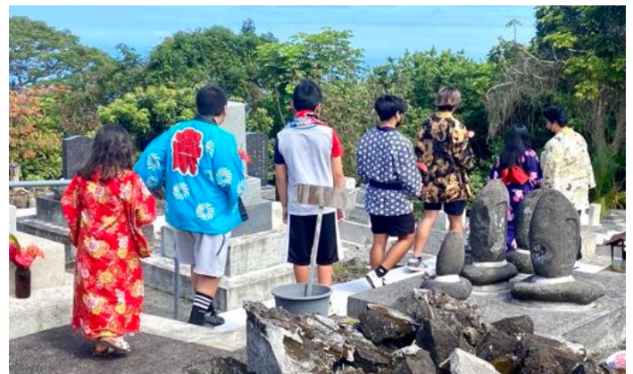
Children placing flowers on all of the graves.