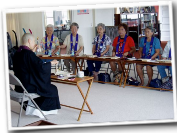
Goeika Workshop, Oct. 22