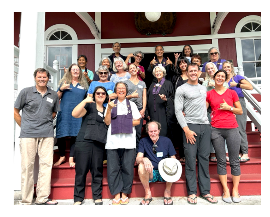
Zen Retreat on October 5