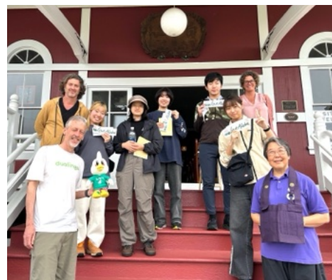
Students from Musashi University in Tokyo, together with their professor, spent several hours at Daifukuji learning about the temple's history, asking questions, and practicing zazen.

Namu kie butsu. We take refuge in the Buddha. Namu kie hō. We take refuge in the Dharma. Namu kie sō. We take refuge in the Sangha.