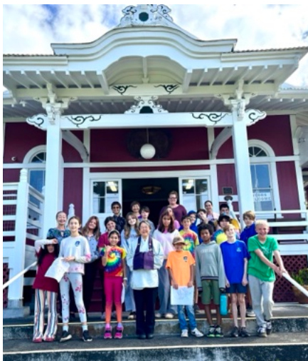
Students and teachers from Kuleana Education Academy recently came to Daifukuji on a field trip and practiced shakyo and zazen.