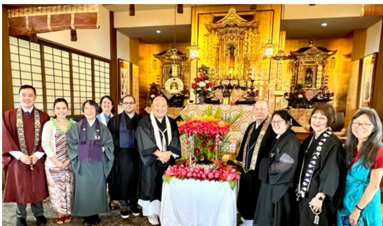
Last Year's HAIB Buddha Day Service